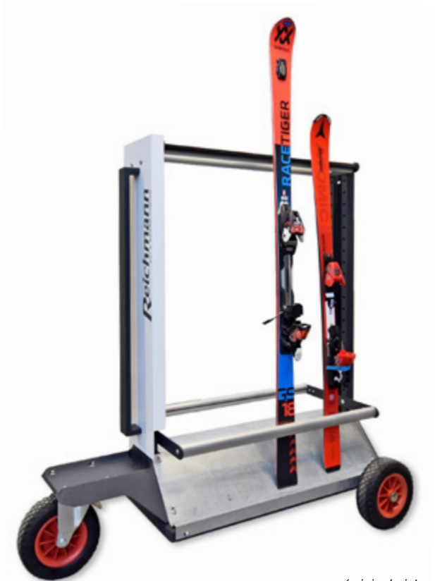
(original picture used ski rack)