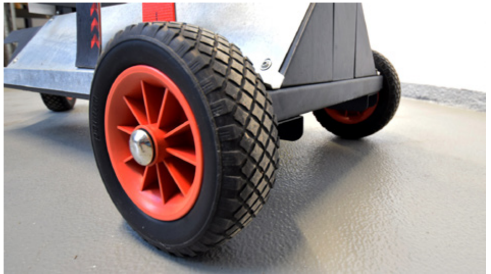
(original pictures used ski rack)