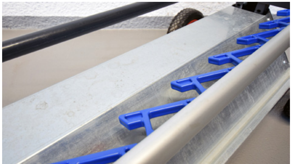
(original picture used ski rack)