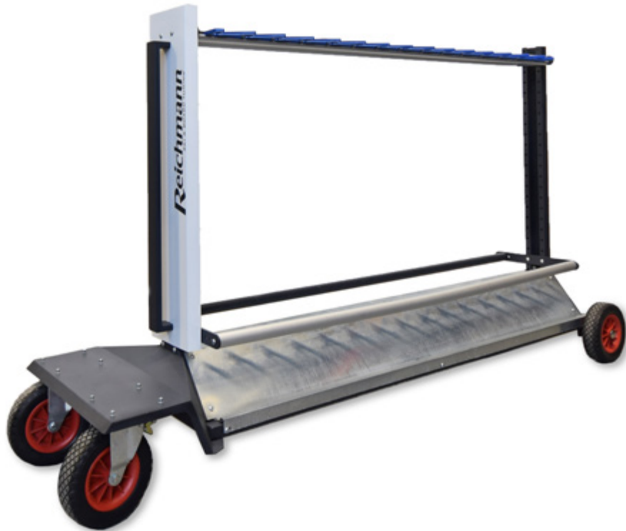
(original picture used ski rack)