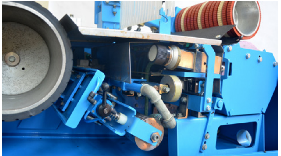
(original pictures of the used machine)