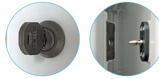
Maximum safety due to mechanical or electronic closing device