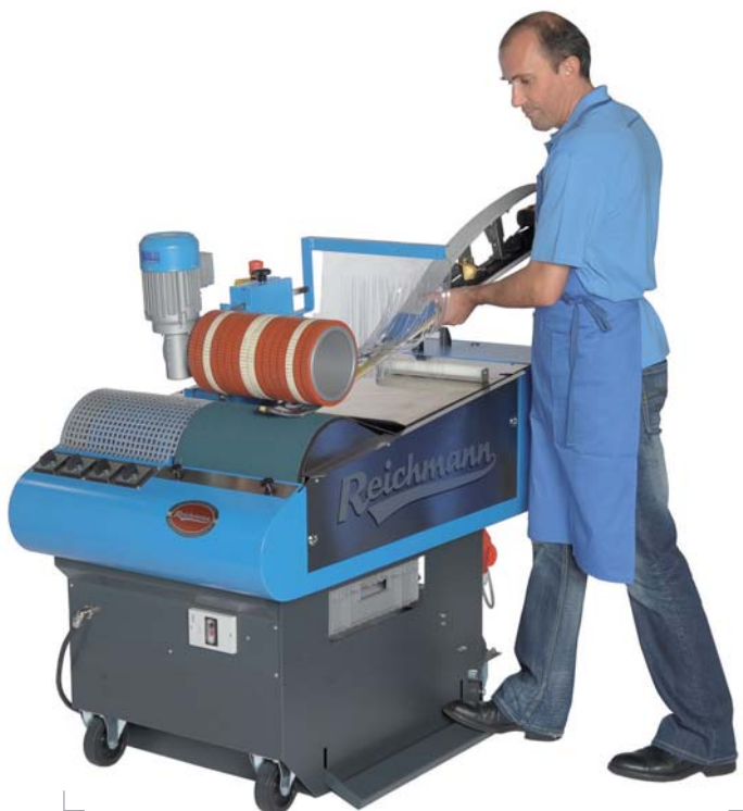
Optional side edge module