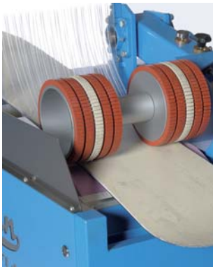
Perfect structures for ski and board