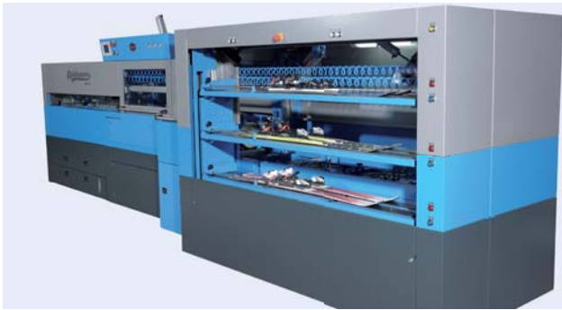
Optional with dis-/charging magazine for more efficient operation