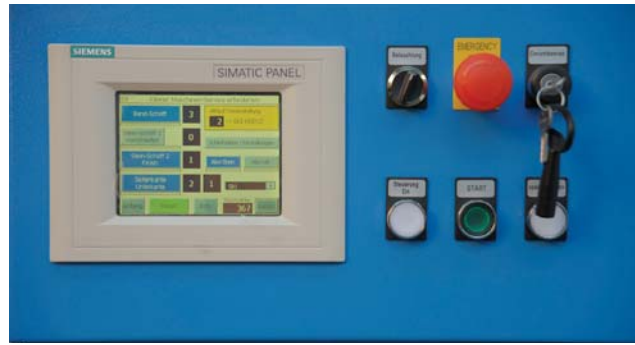
Touch screen monitor - modern and easy to operate