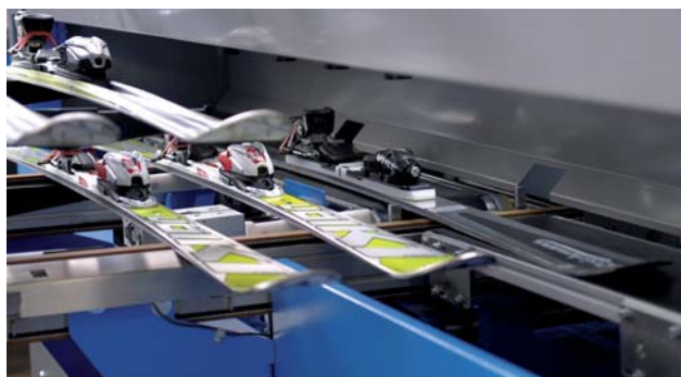
Automatic charging with machine added, accurate centering of ski