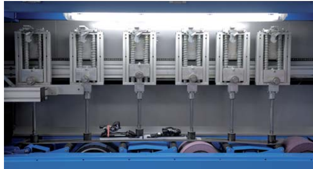
Innovative "one way"-transportation of ski due to fixation arms