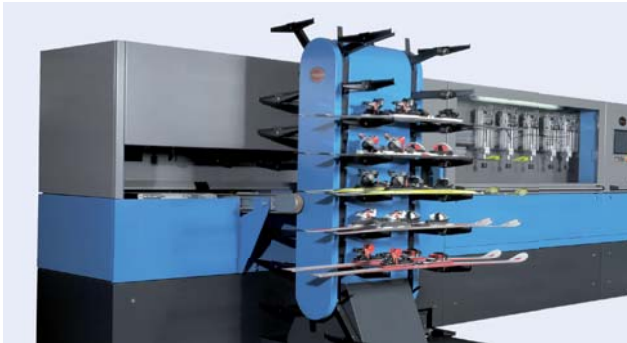
Feeds up to 24 skis at one time via the integrated paternoster