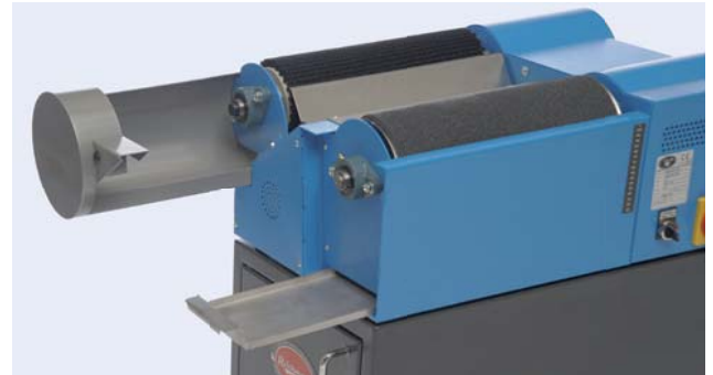
Easily removable sheeting for easy cleaning